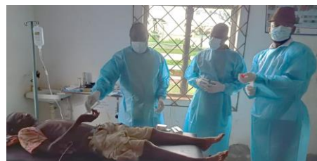
Cholera response at Eketuma Health Center, Abakaliki LGA