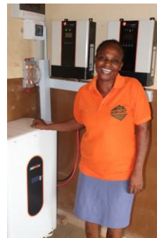
Solar Power Ephuenyim