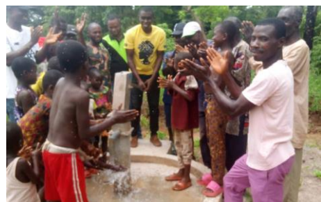
Repair of borehole Offiakum, Izzi LGA