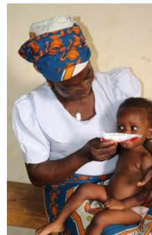
Giving RUTF Aguotu