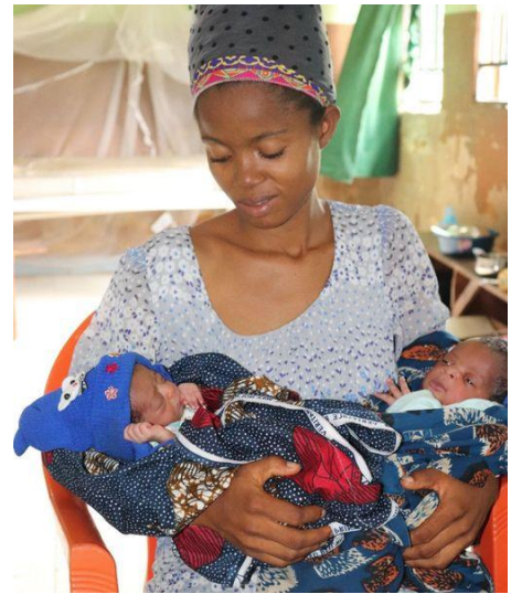
Twins delivered at Mgbaluwku Health Centre