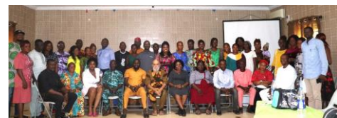
Stakeholder meeting with government, community, health center staff and AMURT team.