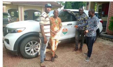
AMURT is grateful to US AID for the donation of a Ford Explorer vehicle.