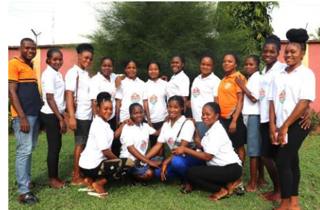
Scholarship students at School of Health Ezzangbo 135.