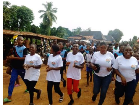
International day of the Girl Child at Offia Oji market with AMURT ASRH team and Village health champions

https://anandamarga.org/pdf/news/africa/AMURTNigeria2023.pdf