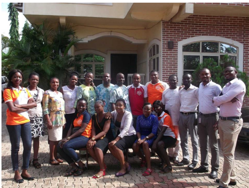
Monthly medical team meeting at AMURT office in Abakaliki