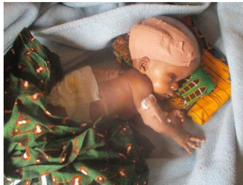
Baby Miracle operated for spinal bifida and hydrocephalus

The AMURT Construction Team, got the use of a new Toyota Tundra truck and was super busy with construction projects in four different project areas. The new staff quarters in Ephuenyim Health Center is close to completion, they are at the stage of plumbing and electrical wiring. At Mgbalukwu the construction of gutters and concreting of the grounds were completed and the building of the staff quarters is underway after long delays. As already told, one small building for Uloanwu health center was completed and is now in use, while the big hospital building is still under construction. In Odeligbo Health Center, construction has started on a new staff quarter.