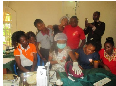
Training for Family Planning Focal Persons at the AMURT office in Abakaliki