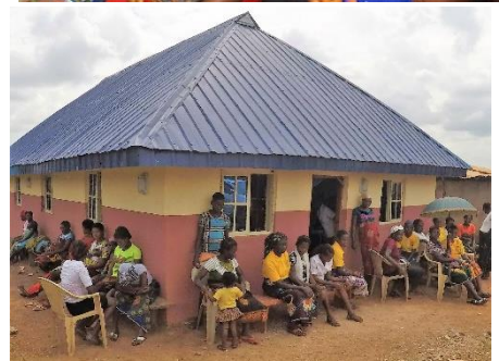
Opening of Uloanwu Health center 2 August. 134 pregnant women