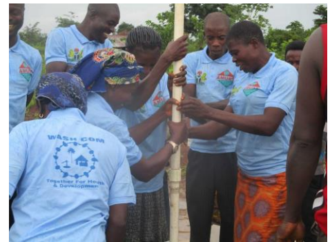
Installation of borehole at Obegu Village in Ebonyi LGA.