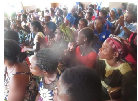
Ephuenyim Health Center ante-natal days draw over 200 women some weeks.