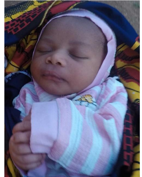
10,000 births Ghelina baby