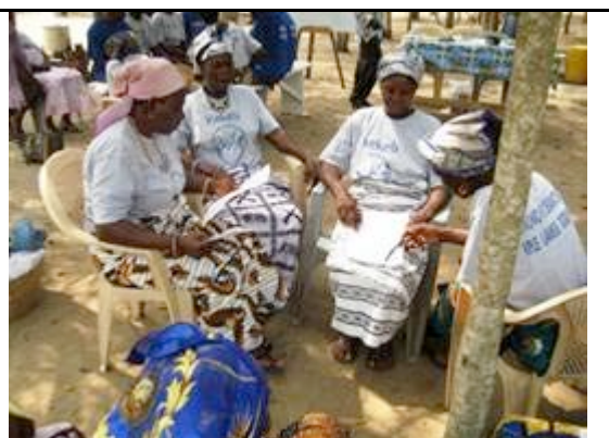
The Kekeli women and the TBA's meet together to o