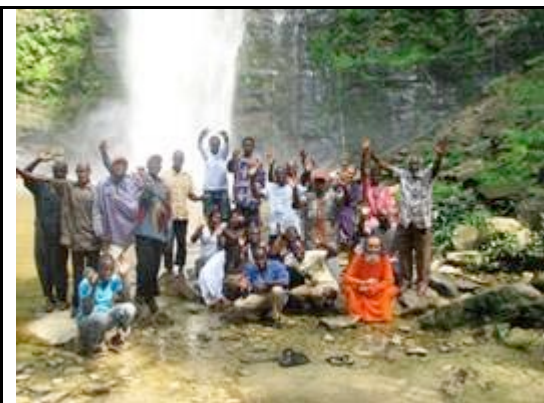
Zongo Water Project staff singing a rousing gospel December