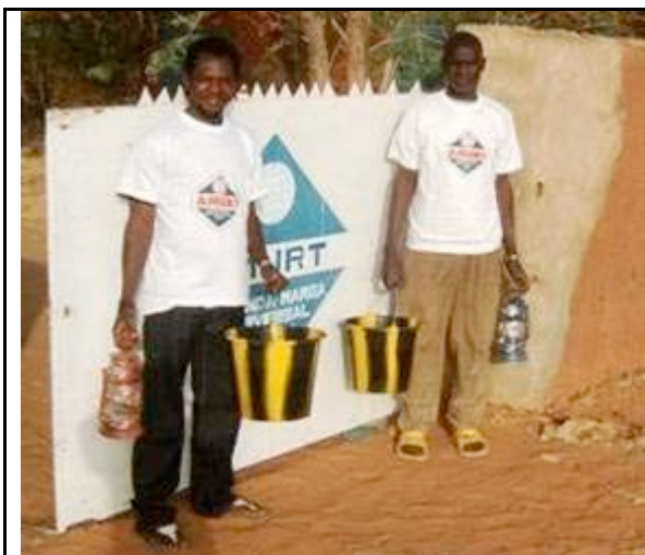
Distributing lamps and buckets

In November we've got some donation from a French organisation, "Aile Universel". As a result, we could provide all our AV's with buckets (for cleaning dirty clothes) and oil lamps (for night births). We could offer two more donkey carts. We selected the more efficient AVs of the remotest villages to choose who will receive the donkey carts. The AVs where so happy to be taken care of and it was such a joyful celebration for those who received the donkey carts!