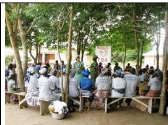
District Health Department reps addressing the Kekeli