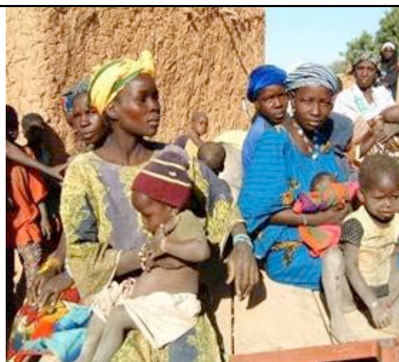
Donkey cart, full!