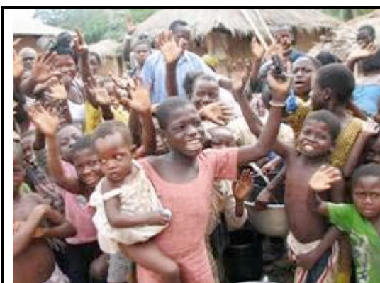
First day of piped water at Avlavikope

Since the beginning AMURT and the Mafi-Zongo Water Project has had a close working relationship with the Mafi-Kumase Water project. We connected Adalekpoe community in April 2008. In January this year Kpokukope was connected. Kpokukope set a wonderful example by completing all the trenches well in advance of the arrival of the pipes. The work at Kpevekor is still not completed, but we expect Kpevekor to be connected in February 2009.