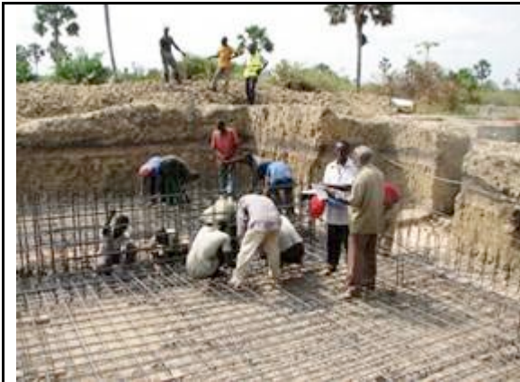
Finishing the reinforcement mat