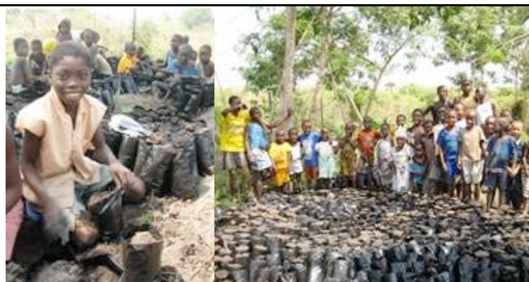
The children worked hard, and had a lot of fun, stuffing the polystyrene seeds of fast growing trees.

We thank our donors for the Mafi-Zongo Water Project