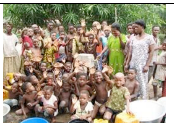
First day of piped water at Mankukope

At Christmas, the plumbers, pump operators, revenue collectors, and zone chairmen to the Wli Waterfalls for a well deserved diversion from the hard work.