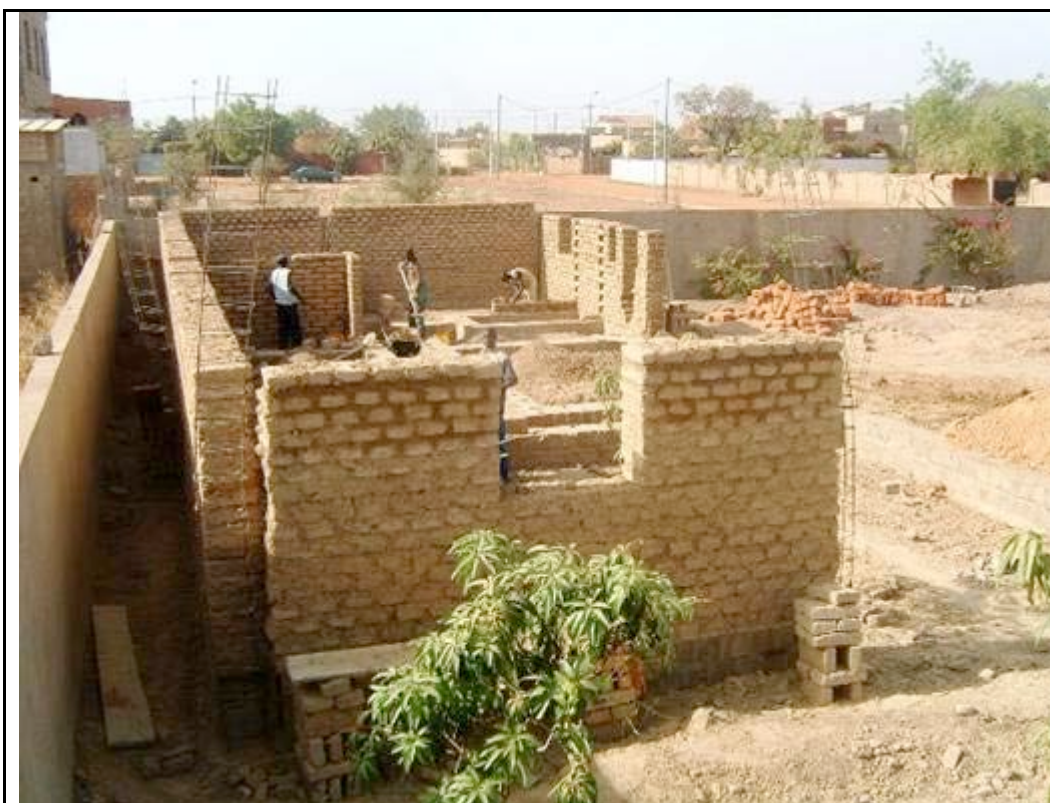
Construction underway on the new jagrti and AMURT center in Ouagadougou. Supervised by b traditional local materials. It will be an ecological building.

We thank our donors for Safe Motherhood and Health Education in Burkina Faso: